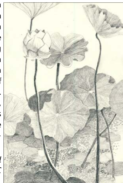
(Continued on page 8)

More information on Fall 2011 art classes at AMC can be found on page 3.